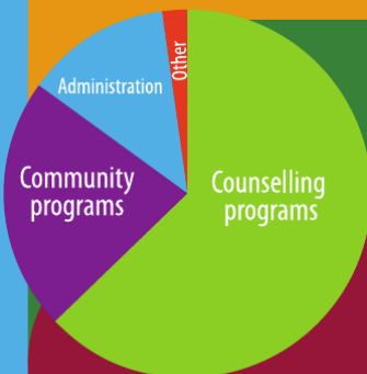
HOW THE MONEY IS SPENT

In 2015: 2504 Volunteer Hours + 45,000 hours of service = 9749 lives improved.