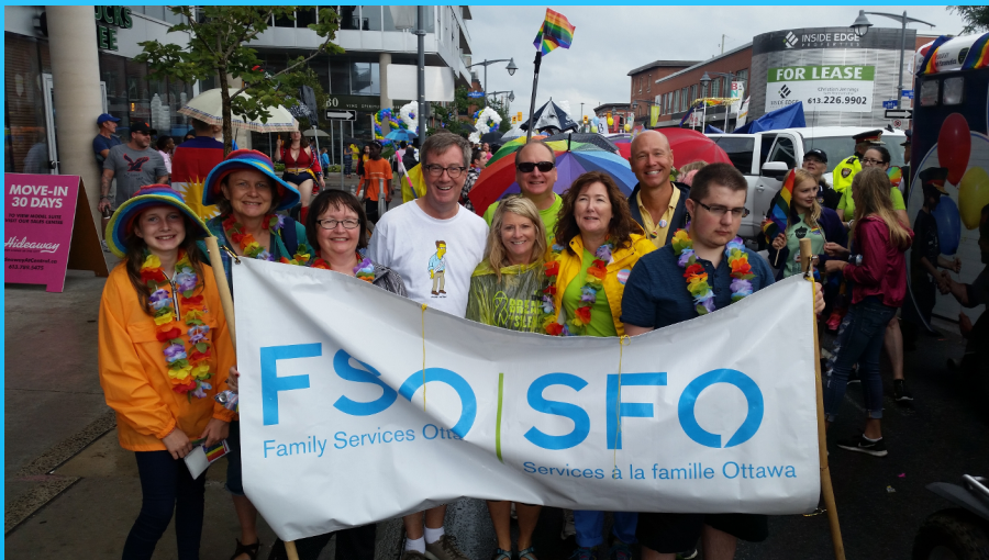
FSO staff, families, & board members walking in the 2016 Capital Pride Parade – they did not let the weather stop them from spreading their sparkle!