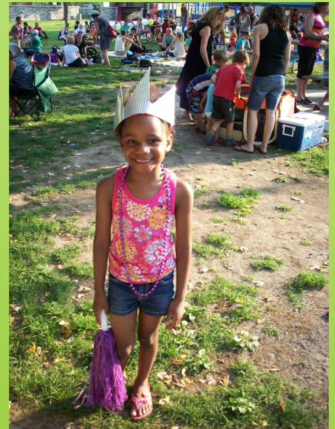
Families at the 2016 Family Pride Picnic