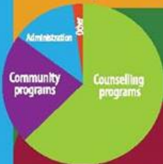
HOW THE MONEY IS SPENT

2700 Volunteer Hours + 67,000 hours of service = 13,100 lives improved.