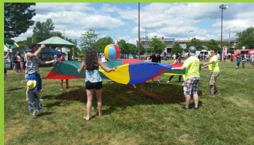
The FSO team and their families volunteering at Westfest